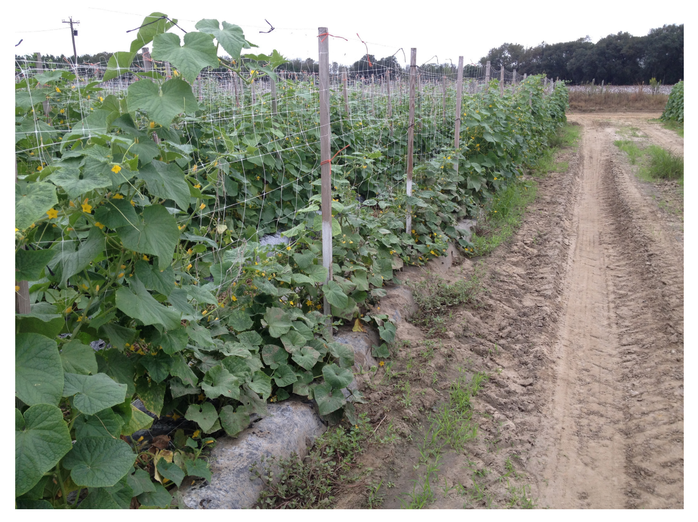
This picture shows severe stunting in cucumbers caused by Root Knot Nematode, Norman Park, Georgia USA.

"Several nematode species are also vectors for viruses, which is why nematode numbers are not always related to the symptoms seen on the crop."