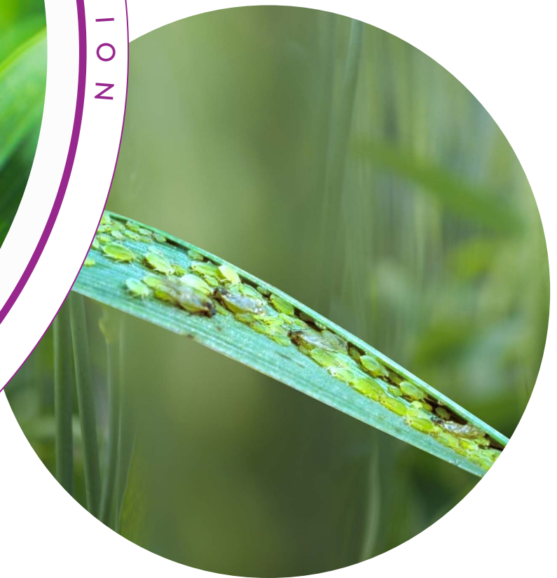
Russian Wheat Aphid

PYRINEX QUICK is a combination of two different molecules and therefore has efficient activity against a wide spectrum of pests