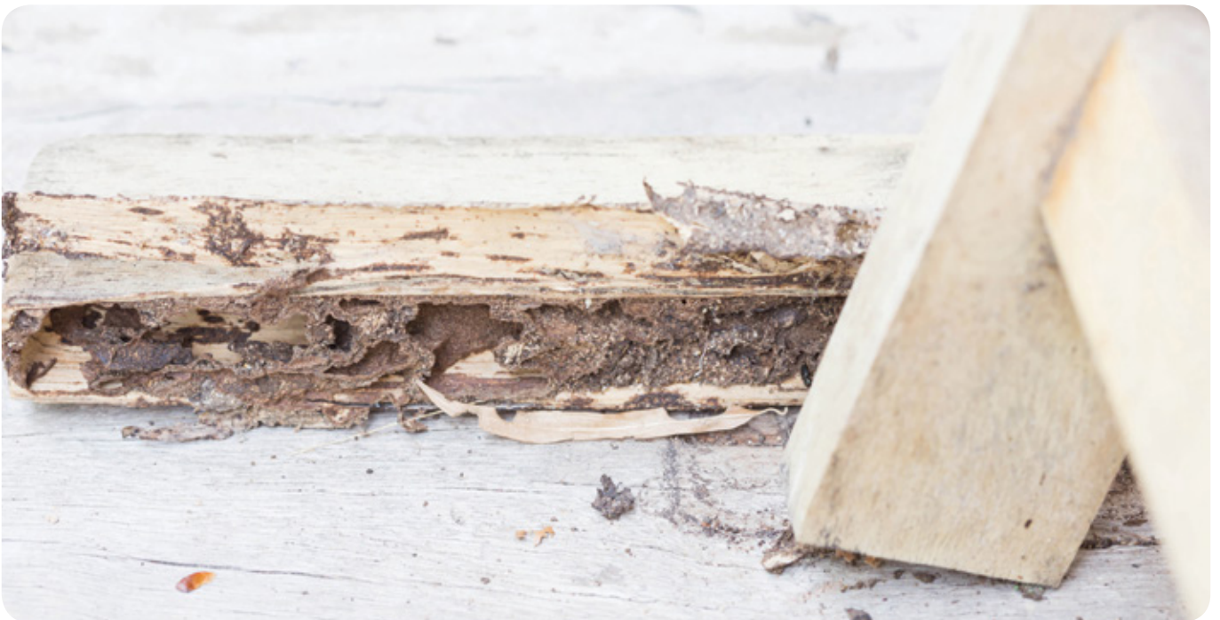
Typical Termite Damage

A common species that nests in coastal bushland from Cairns to Sydney and forms distinctive round ball-shaped nests that are especially abundant in the years following major bushfires (as it mainly nests in stressed trees). It can also damage fences, poles and wood on the ground, but it rarely attacks buildings.