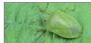
Green vegetable bug